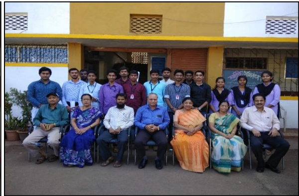
AVISHKAR-ZONAL LEVEL WINNERS