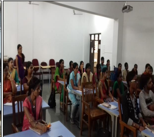
Studt Visit at SPPU Department of Microbiology