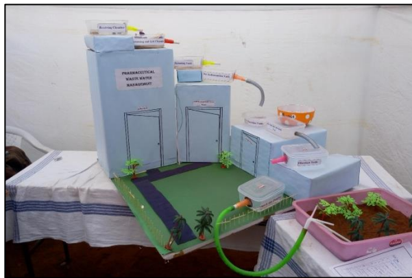
Pharmaceutical Indistry model by SYBSC students