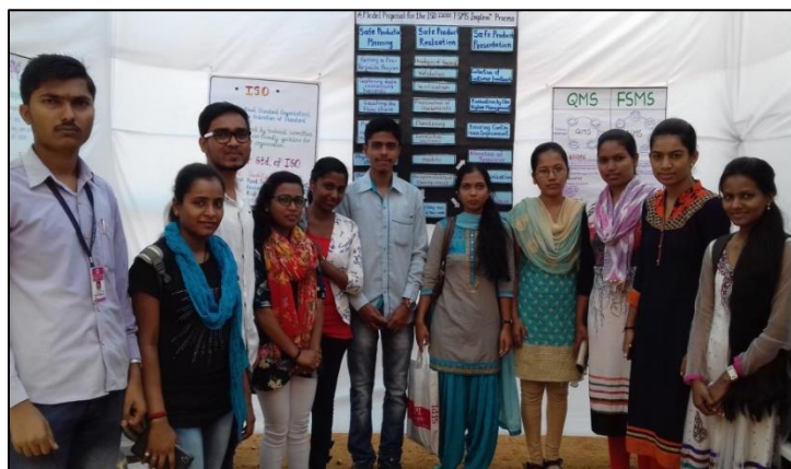
Poster Presented by T.Y.B.Sc. students