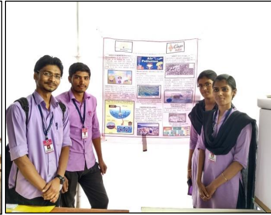
Model Making –Winners (SYBSC)